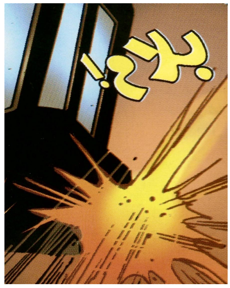
Detail from Conceptual Manifestation

This work is simultaneously something, and nothing. A grouping of visuals from comics found in Egypt have been enlarged and subtly altered, focusing on onomatopoeiac arabic text. The depictions of violence, intended primarily for the consumption by the youth, have been taken out of their original context and put into a new ambiguous one. The addition of wooden handles transform what would normally be posters into protest signs (meant for performance). Could a silent protest, only connoting noise, take place? And if so, what are the connotations of such an action in a solo or group context? What might it mean to use the form of protest conceptually exactly where the Revolution took place some ten years ago?