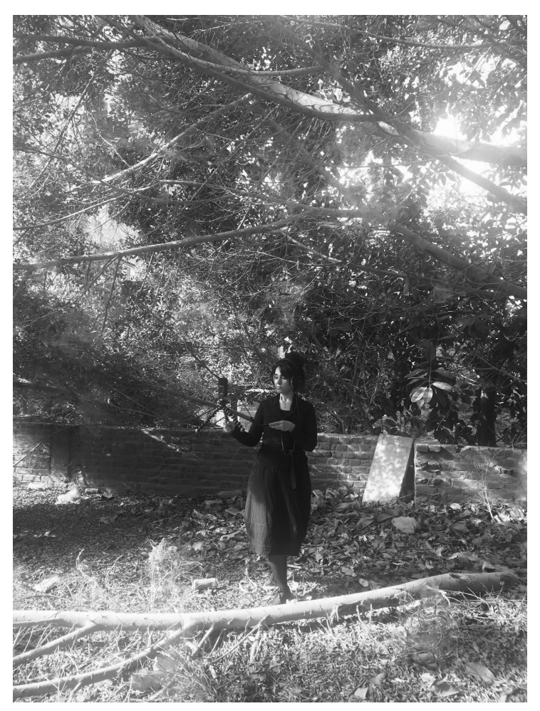
Cairo Waves. 2019.